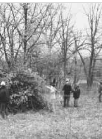
New Trier students add to brushpile.

dirt, mud and plants growing along the borders slide into the water and disintegrate, filling the bottom with sediment. The water silts up, degrading the habitat for fish. When the plants disappear, so do insects, dragonflies, butterflies and even small fish, which use the plants to hide from turtles and larger fish. Flooding wipes out habitat for all these critters, along with the food chain for birds and large fish.